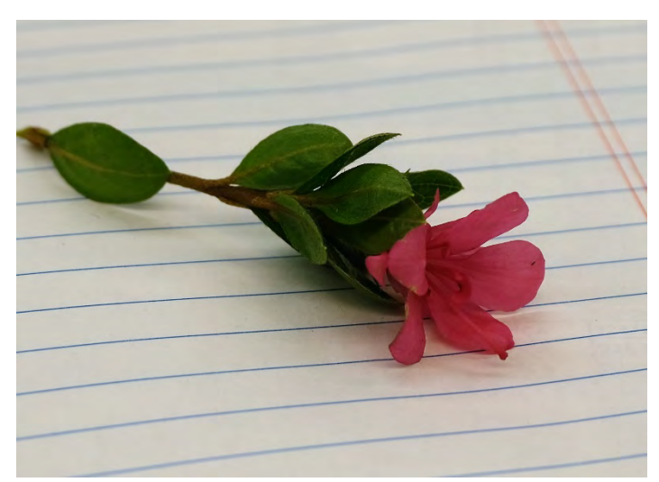
A lot of the camellia flowers are ending, but the azaleas are still going strong. He paired flowers with