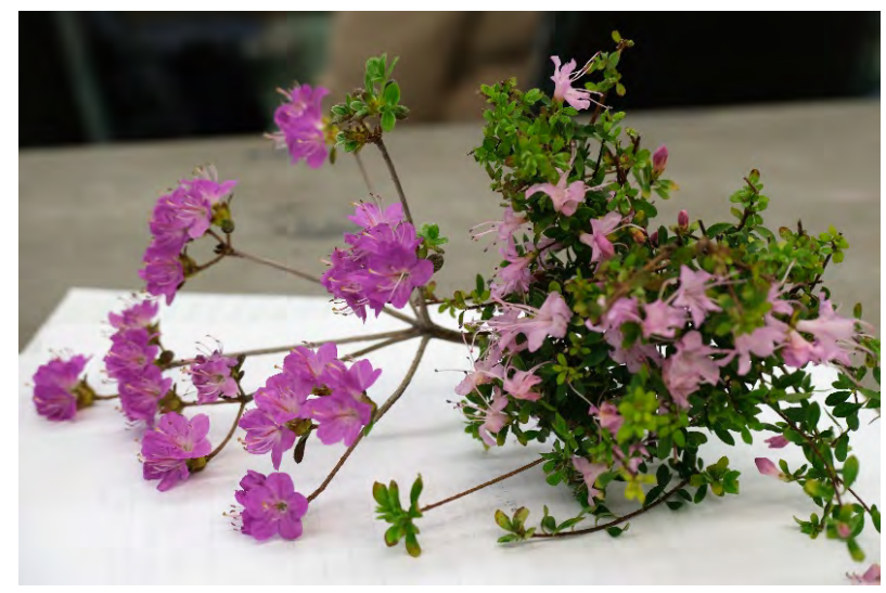
Look at the different sizes of flowers. Then look at the

Satsuki azalea, right, flowers can be solid colored or variegated. Then look at the flowers Tom holds on the right. The flowers are