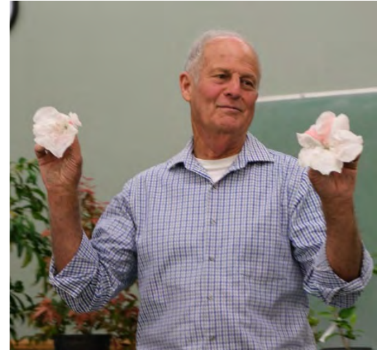
as big as his fist!

Now look at different leaves. On the top left corner, you see a plant with leaves that are a mixture of greens and bronzes. The plant is upright, and the leaves are flat